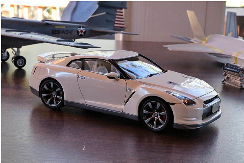
Nissan R35 GTR