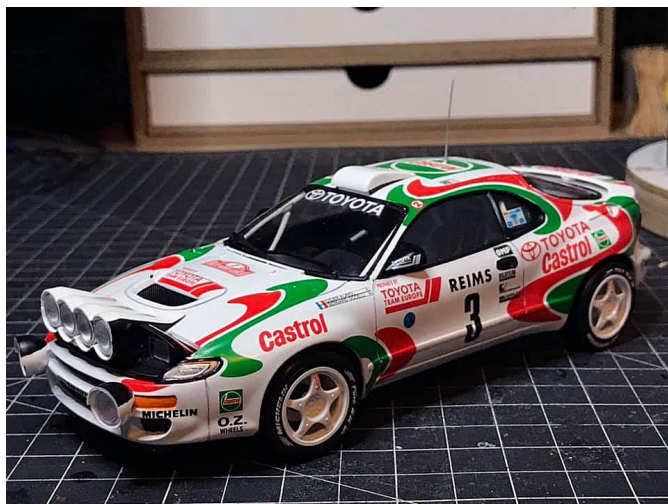
Toyota Racing Car