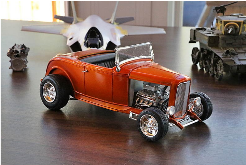
By Terry Sumner 32 Ford